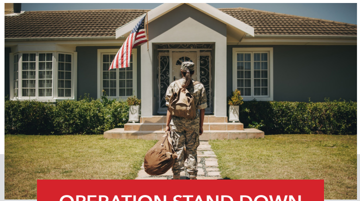
OPERATION STAND DOWN

GFWC Viera Woman's Club (FL) wanted to help the homeless so the club reached out to Streetside Showers, an organization that provides shower trailers, to place one in the area. Before this project, the homeless were bathing in the canal. Club members also collected socks, t-shirts, toiletries, and personal hygiene products. A collection box has been set up for continued support of this project.