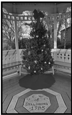
Shown to the left is the Dillsburg GFWC Woman's Club Quay Park Holiday Tree.