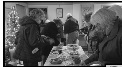
On the top right, patrons enjoy refreshments at the club's holiday play fundraiser - A Little Women's Christmas , at Mechanicsburg Little Theater.