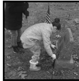
Girl Scout placing a wreath.

The GFWC Saxonburg District Woman's Club was the sponsoring group for a Wreaths Across America campaign to cover veterans' graves at the Saxonburg cemetery.