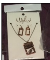
Necklace & Earring Sets

Here is what we have left in jewelry stock from our established fundraisers: Five (5) pink stone bracelets, Four (4) Believe necklace and earring sets, one (1) silver Fearless set, one (1) brass Blessed set, and 1 brass Hope set. Garment Bags are still available at a SALE price of $10. each.- remember too that they make a great closet organizer for wrapping paper, and other wrapping needs.