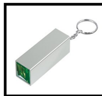
Manicure Sets $4.74 + 0.26 tax = $5.00

Manicure sets round out our items. These sets have GFWC Pennsylvania and the Mountain Laurel on them and can be used as a key chain or to connect to a zipper inside of your luggage or purse for easy use. The price of the set is $5.00 each.