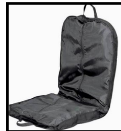
Garment Bag $14.15 + 0.85 tax = $15.00

Manicure sets round out our items. These sets have GFWC Pennsylvania and the Mountain Laurel on them and can be used as a key chain or to connect to a zipper inside of your luggage or purse for easy use. The price of the set is $5.00 each.