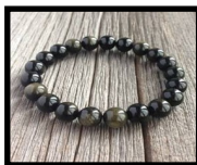
Beaded Stone Bracelets $9.43 + 0.57 tax = $10.00 Pink, White, Brown Black, Grey

The price of the bracelets is $10.00 each and will make great gifts.