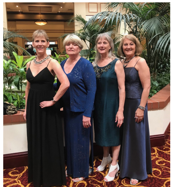
121st GFWC Pennsylvania Business Meeting & Convention Cranberry Township, PA May 18th & 19th "It's A Celebration!"